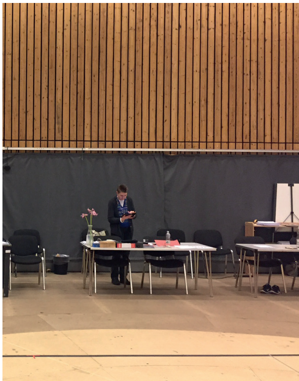
An actor's-eye view of the production desks in the rehearsal room