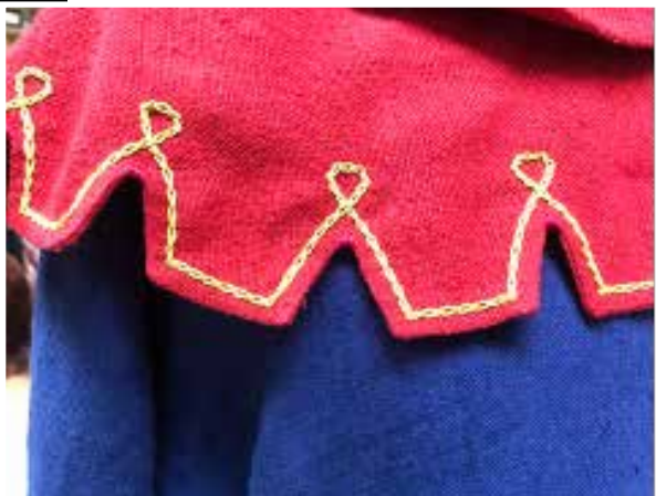
Detail on the Boy's costume