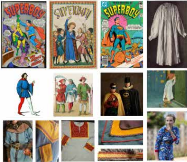
Inspiration for the Boy's costume