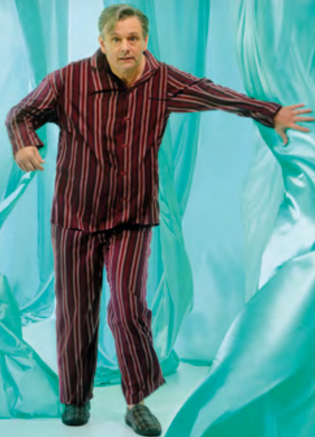
Photography (Michael Sheen)