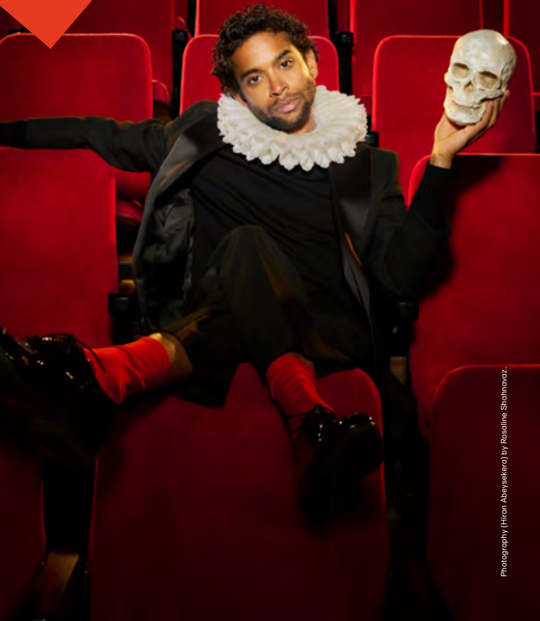
Photography (Hiran Abeysekera) by Rosaline Shahnavaz.