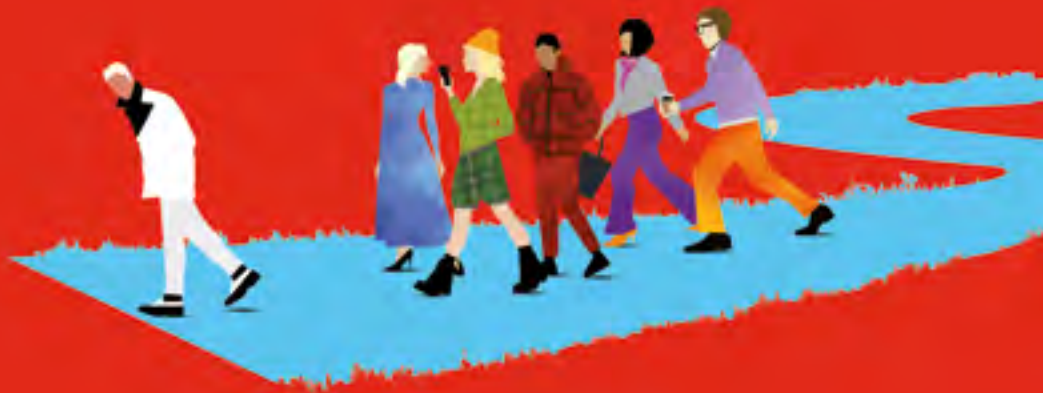
Illustration by AKA NY.